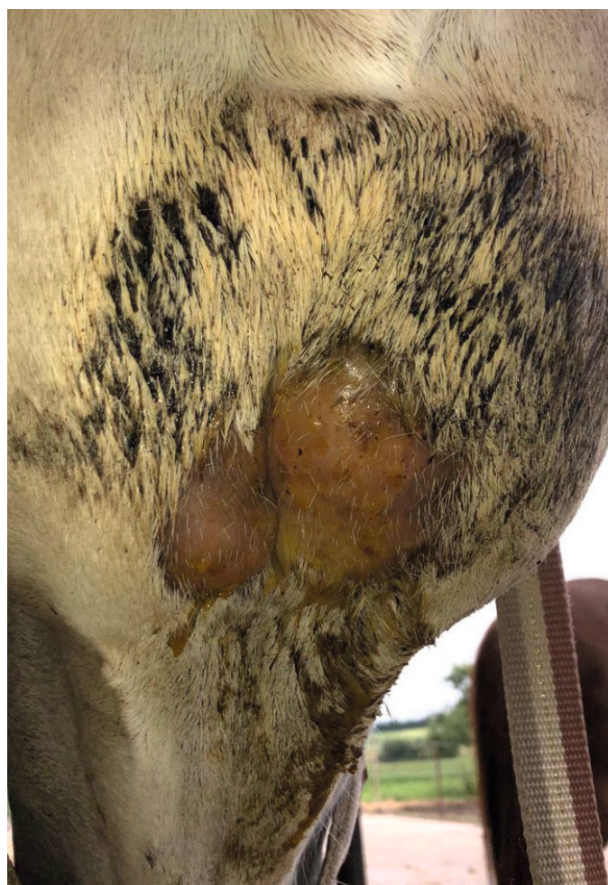
Fig. 2: Inflammatory enlarged mandibular lymph nodes with suspected abscess formation in a horse. Here, determination of acute-phase proteins (SAA) can be helpful for a more accurate assessment